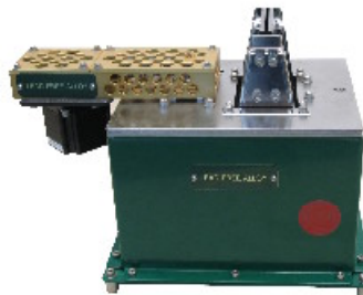
"The soldering process"